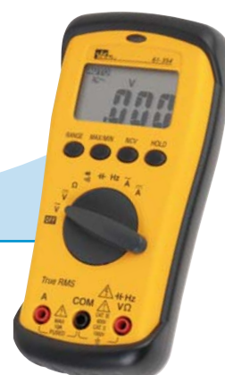
▶ 61-354 features: