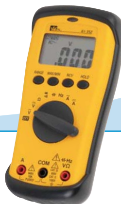
▶ 61-352 features: